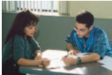
UCB students studying together.

The English Support Workshops are held every Friday (except as noted otherwise/holidays, etc.) from 6-8